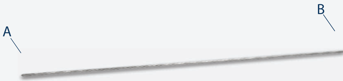
detalj A / detail A